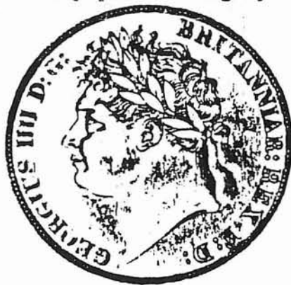
the laureate head of George IV on an 1822 crown.

The George III crowns of 1818 to 1820 have the Pistrucci St. George encircled by the Order of the Garter. The archaic French "Hone soit que mal y pense" roughly translates: "Evil to him who thinks evil".