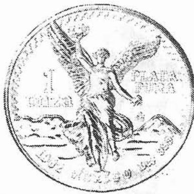
Mexican Libertad is a silver coin.

The Casa de Moneda in Mexico City struck 950,000 examples of the coin in 1982, but the government chose to withhold them from sale until now. Each contains exactly one ounce of .999 fine silver. According to Mexican officials, no further 1982-dated pieces will be struck and future issues also