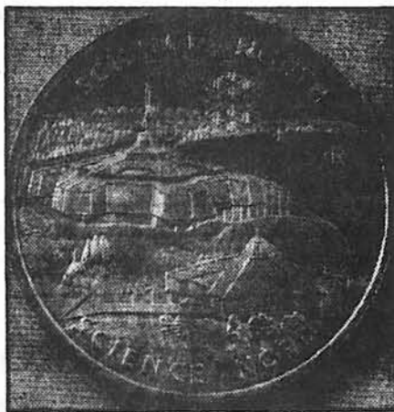
Newly minted: Medallion marking opening of Science North was made with process developed by Inco.

In the case of the Science North medallion, pure nickel strip produced at the Canadian Alloys division of the company was punched into blanks and rimmed (the adding of a raised edge) at the Royal Canadian Mint. Then the blanks were gold-plated, and the gold