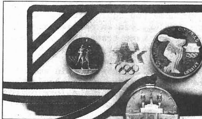
THE COINS: USA sales revenue stands at $250 million so far.

U.S. Treasurer Katherine D. Ortega says the government has sold $250 million in gold and silver coins since the program began last year. Officials