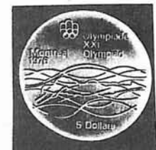
THE SWIMMER $5

The three Olympic paddling events—rowing, canoeing and kayaking are symbolized by a single heroic figure pitted against time, pressure and fatigue. The fluid curve of the watercourse swirls around him.