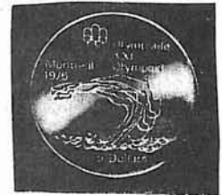
THE DIVER $5

Let's make it rough for the Chairman this year and give him some real opposition from which to choose the final Candidate for the Annual Award of Merit.