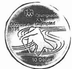
THE PADDLER $10

The graceful woman diver is shown passing through a time lapse sequence before completing her dive. As seen from the diving tower, light shimmers below her on the surface of the water.